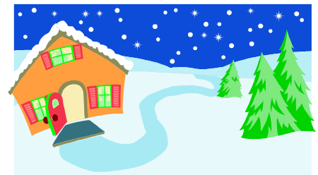
Cold Winter Months are more difficult for those in need.

prescription regimen set forth by his or her doctor because of financial hardship such medications can entail. The Pharmacy's goal is to dramatically decrease the number of re-hospitalizations that result from this hardship. The organization will be able to connect with these patients prior to their